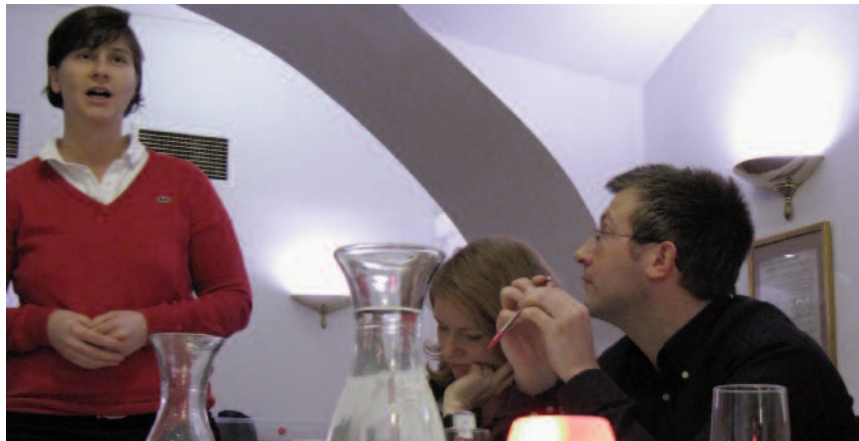
Scenes from a meeting II: It is speaking and listening...